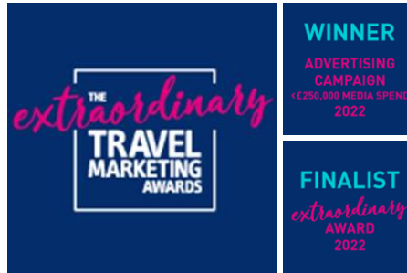
The Travel Marketing Awards

Reviews from millions of Tripadvisor travellers place Greenwich in the top 10% worldwide.