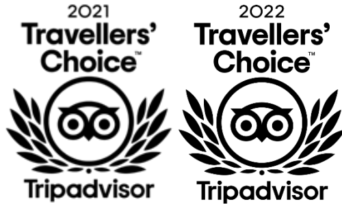
TripAdvisor Travellers' Choice Award Winner 2021 & 2022

Reviews from millions of Tripadvisor travellers place Greenwich in the top 10% worldwide.